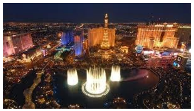
February 26 — 28, 2015 Alexis Park All Suite Resort, Las Vegas, Nevada